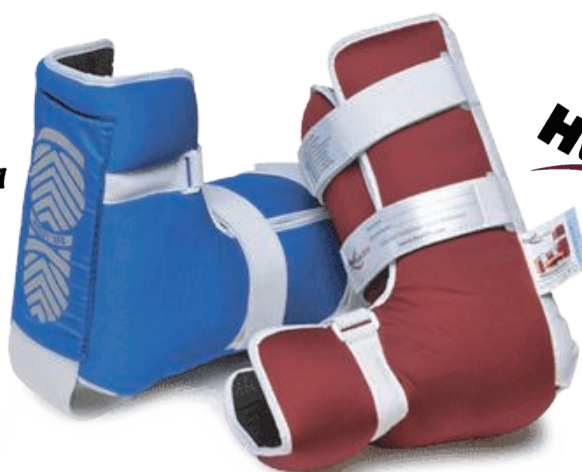
HEELIFT Glide Ultra